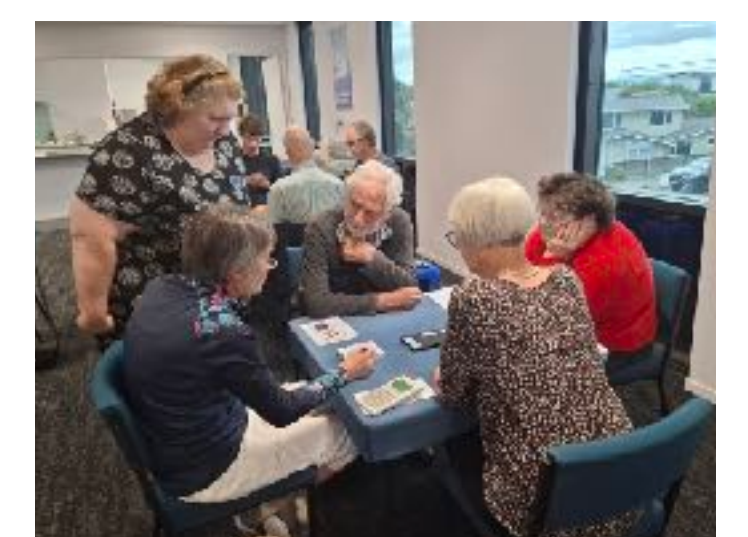
Footnote - sadly the FotB trophy went over the bridge and is just waiting to be re homed in 2025.